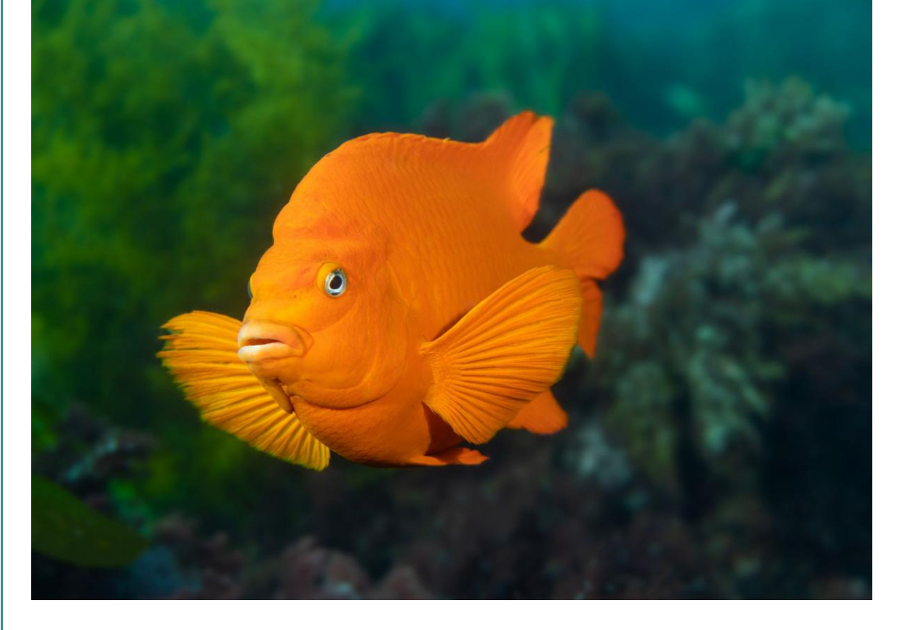
Support Clean Water

Want to make a difference for the environment and your community? Making a tax-deductible contribution to Santa Barbara Channelkeeper today is an investment in clean beaches, healthy watersheds, and a more sustainable future.