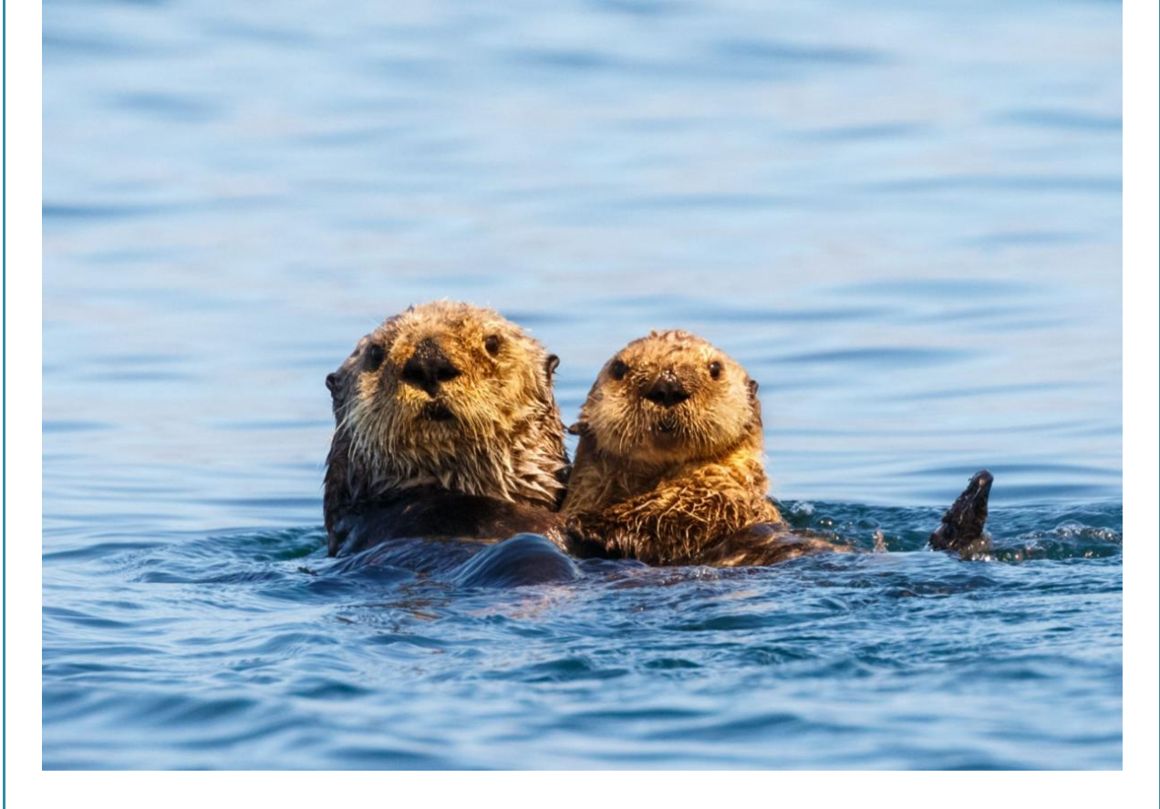
Support Clean Water

Want to make a difference for the environment and your community? Making a tax-deductible contribution to Santa Barbara Channelkeeper today is an investment in clean beaches, healthy watersheds, and a more sustainable future.