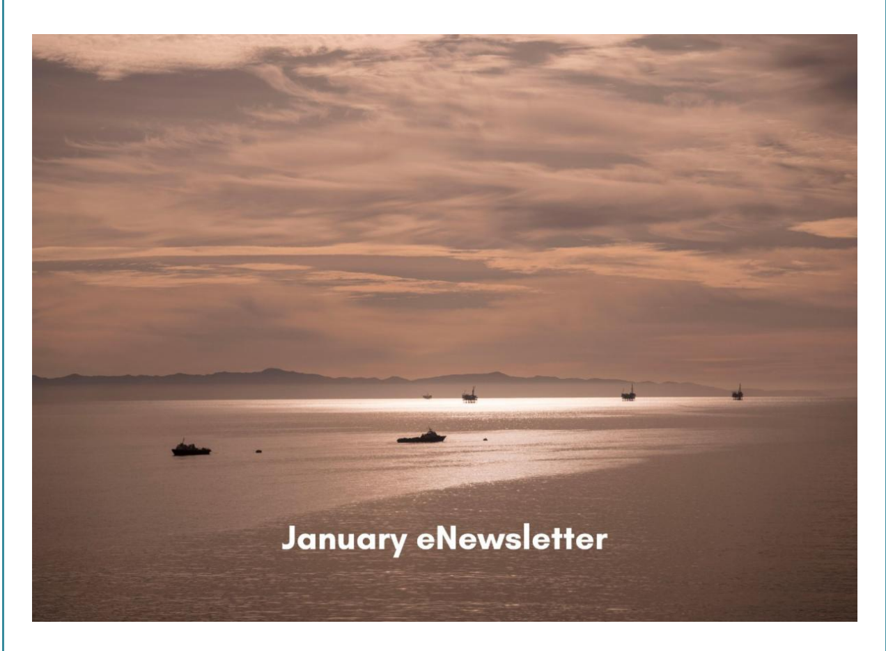
Voice Your Opposition to the Reactivation of Offshore Oil Operations Along the Gaviota Coast

Texas-based oil company Sable Offshore continues to push forward with plans to restart oil production from the three platforms of the Santa Ynez Unit and convey the oil through the same corroded pipeline responsible for the devastating 2015 Refugio Oil Spill.