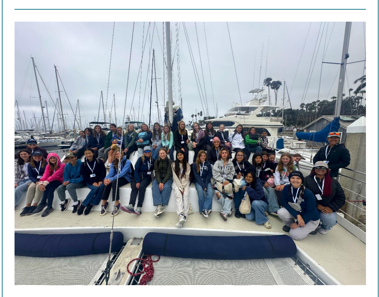
GIRLS IN OCEAN SCIENCE CONFERENCE 2024

Channelkeeper was honored to participate in the Santa Barbara Maritime Museum's Girls in Ocean Science Conference 2024! The conference took place on September 28th for middle school students with boat time on the Double Dolphin and in the labs, and on September 29th for high school students aboard the Channel Islands National Marine Sanctuary's research vessel, Shearwater .