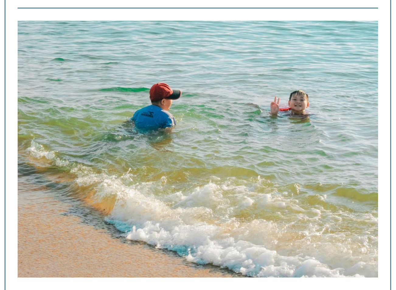
CELEBRATE SWIMMABLE CALIFORNIA DAY July 25

Join us in celebrating clean, swimmable water! Swimmable CA Day is a day recognizing your right to waters that are safe for recreation.