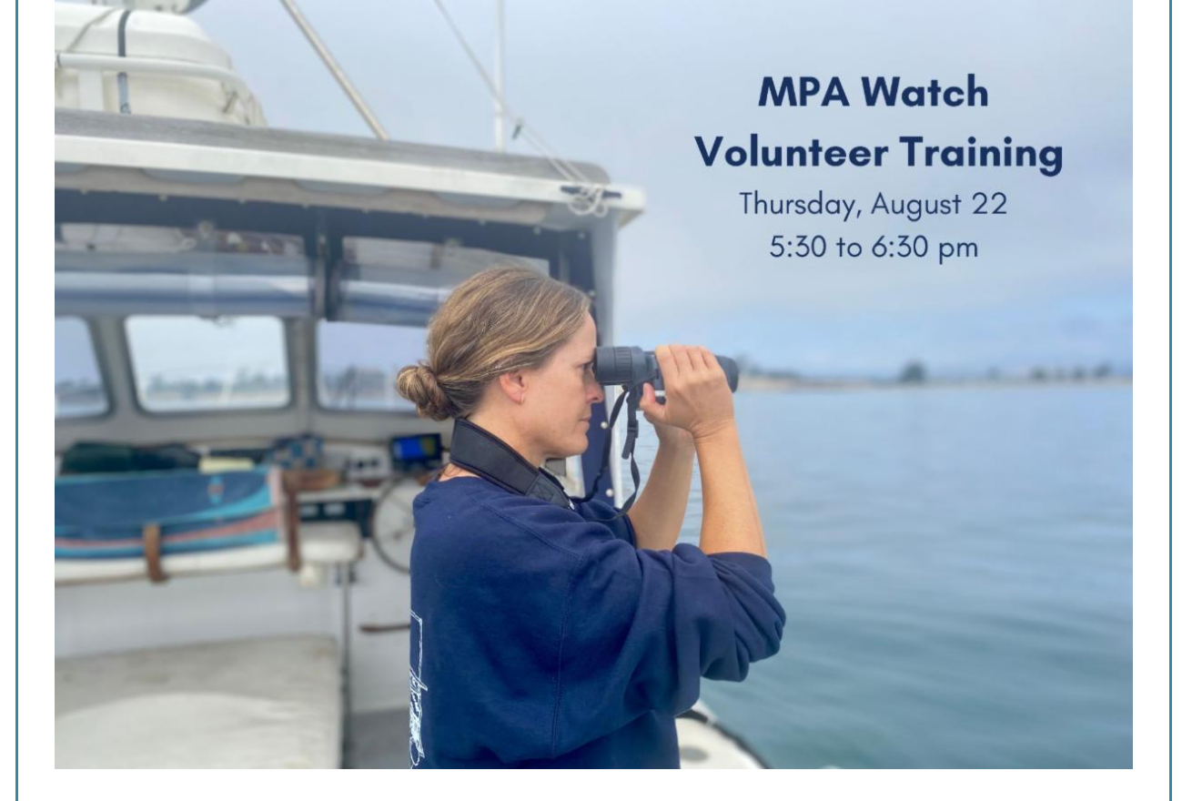
MPA Watch Training Thursday, Aug 22 5:30 to 6:30 pm

Are you interested in becoming an MPA Watch volunteer? Sign up for Channelkeeper's Virtual Training on August 22, from 5:30 to 6:30 pm.